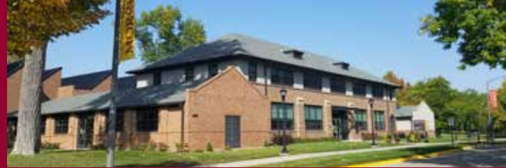
Connect with the Admissions team in the Welcome Center.

Enjoy a virtual tour from the comfort of home! morris.umn.edu/virtualtour