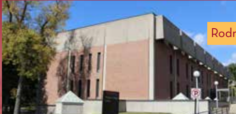
Rodney A. Briggs Library

state-of-the-art labs, classrooms, and observatory for science and math