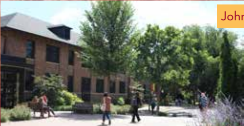
John Q. Imholte Hall

resources for clubs and orgs, Edson Auditorium, Higbies coffee shop, and Turtle Mountain Cafe