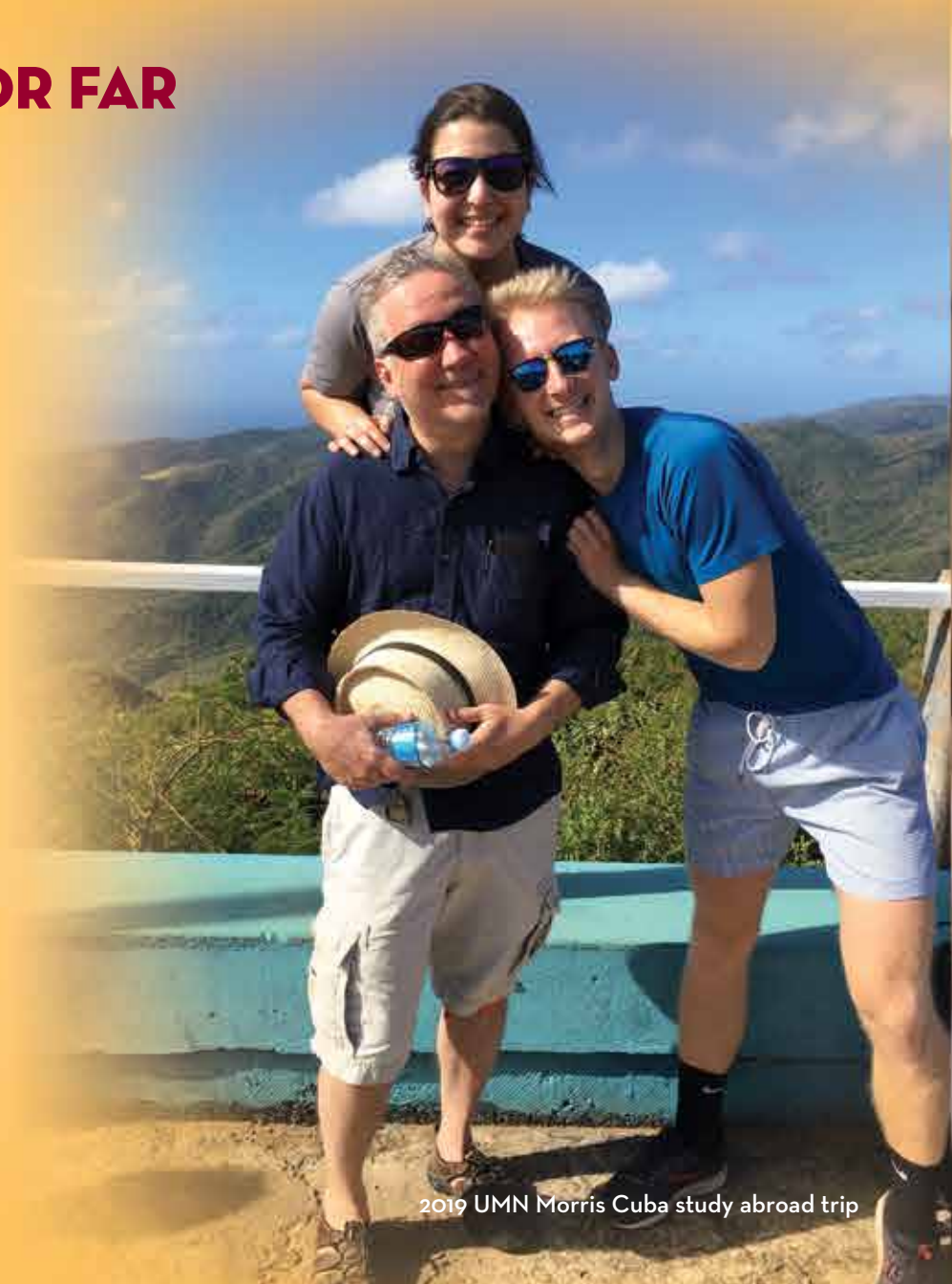
2019 UMN Morris Cuba study abroad trip

Participate in community engagement opportunities and make a difference right at home.