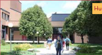
Humanities Fine Arts

study spaces, access to academic journals, research and class assistance